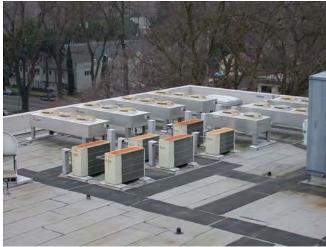
Data Air / Liebert