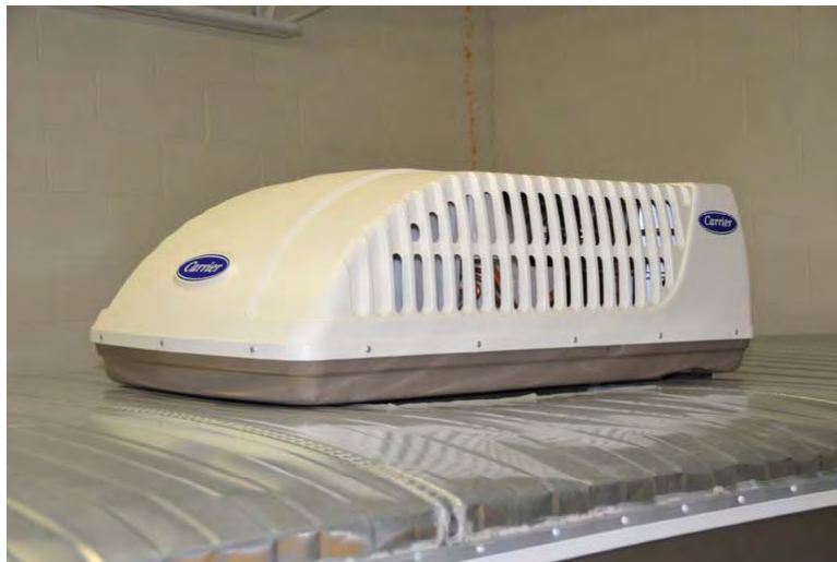
Guard Shack AC