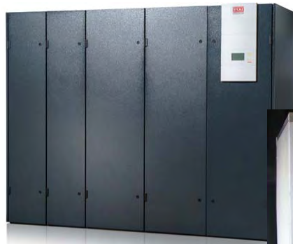
Data Air / Liebert