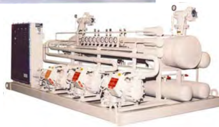
Ice Rink Chiller